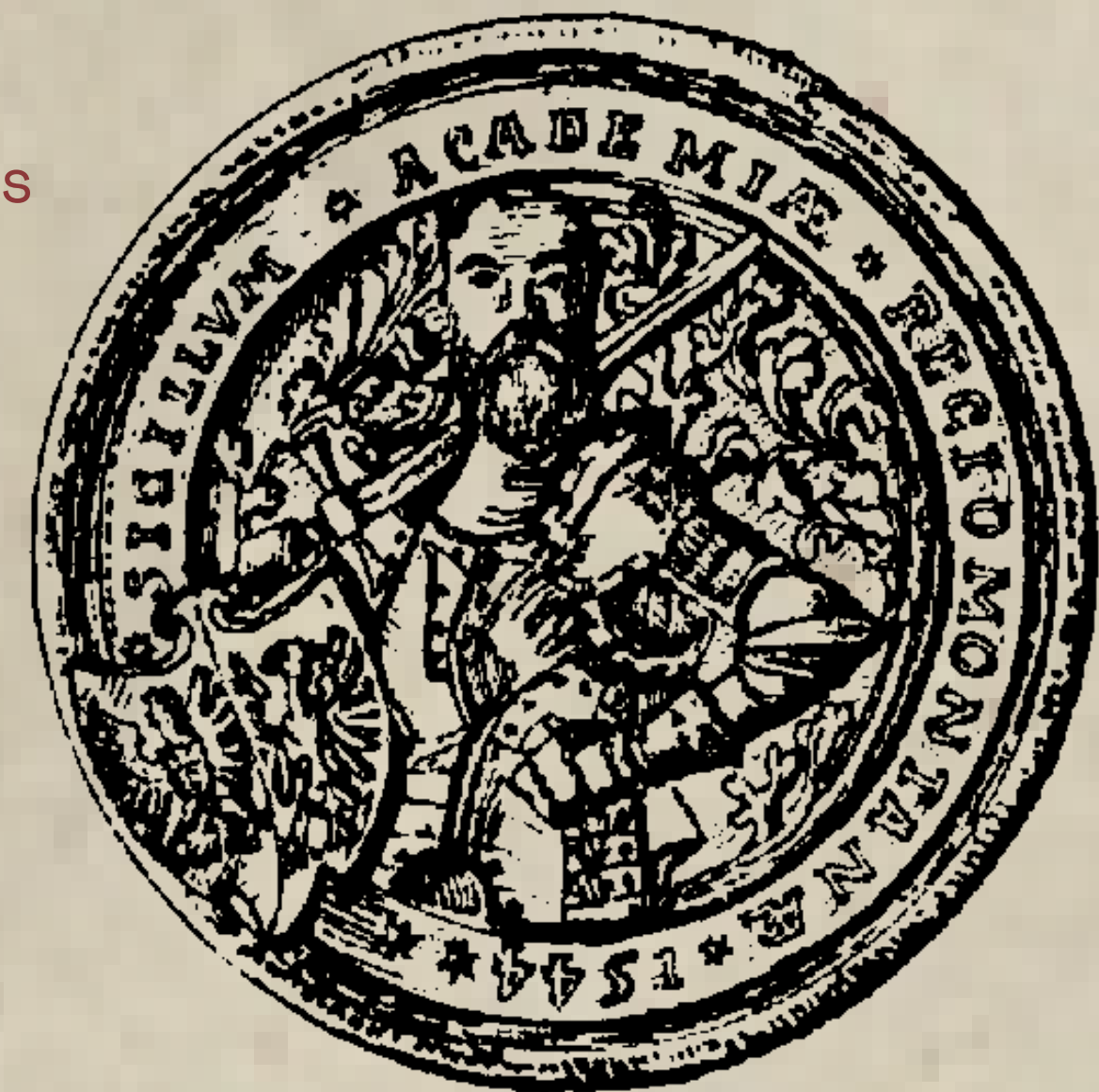
Seal of the University of Königsberg